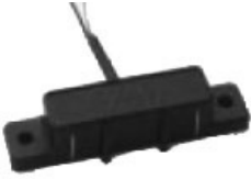
9K585 Moisture Sensor with Relay