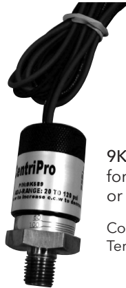
9K589 Over-Pressure Switch for use with Aquavar SOLO 2 or "S-Drive" Controllers