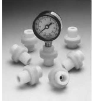
6K210 Gauge Guard

Float Switches - tested for use with Aquavar SOLO 2 Controllers